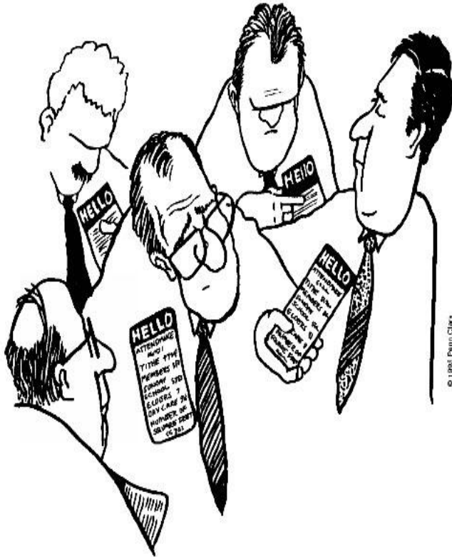
Statistical name tags drew the pastors closer than the ones that just say "Hello, my name is . . ."